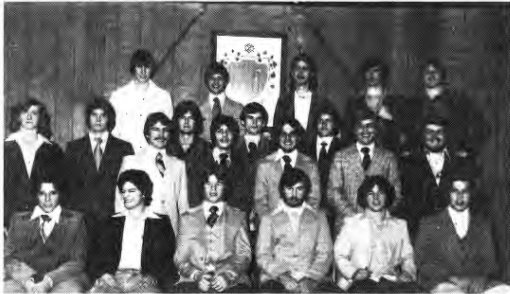
THE TWENTY-TWO NEWEST CHI PHIS