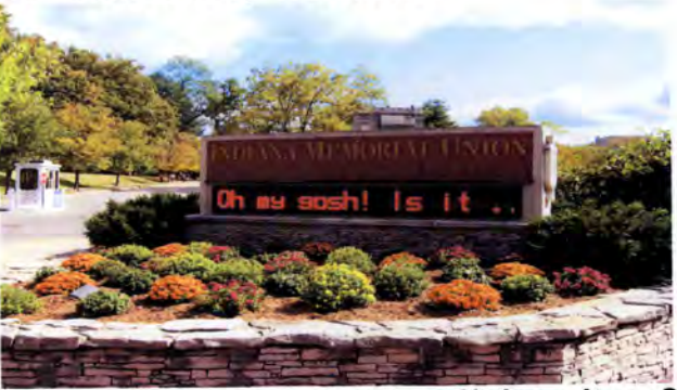
lota Delta Chapter - Indiana University - 9/26-28/08

Notwithstanding the final gridiron results at Memorial Stadium, September 27 was an althogther perfect day. Iota Deltans came from North and South, from East and West; from all over Indiana and surrounding states. September 26-28 was an incredible weekend for marking the 50th Anniversary of Chi Phi at Indiana University: The Iota Delta Chapter.